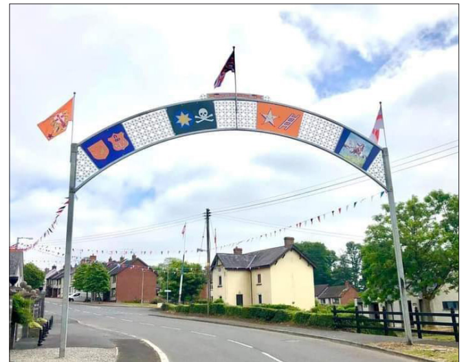
Above left and right: Killylea Orange Hall and Arch.