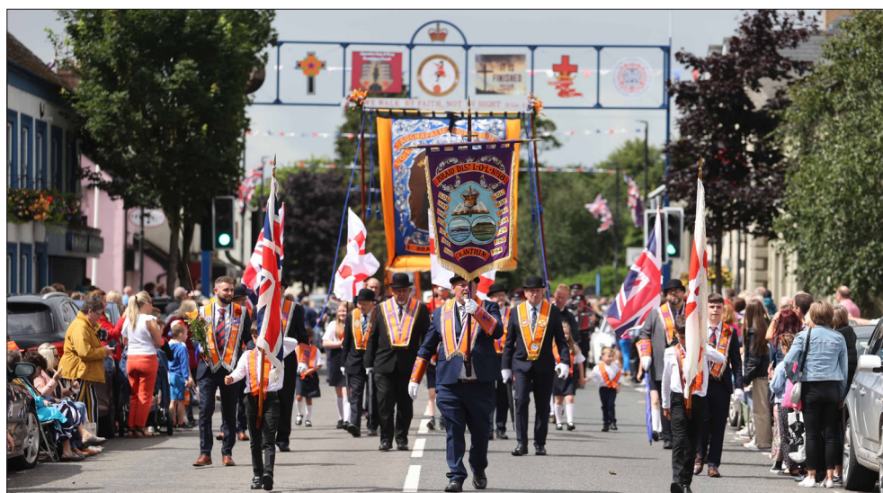
The Braid Twelfth will return to the village of Broughshane. This year it is Buckna LOL 489 who have the honour of hosting the celebrations.